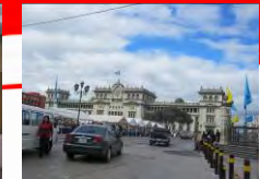
Passing through Guatemala City

Thank you for your faithful prayers and your generous giving .