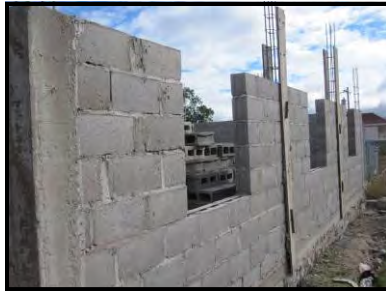
Putting up the walls and columns