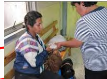
Our church people handing out food at the hospital.