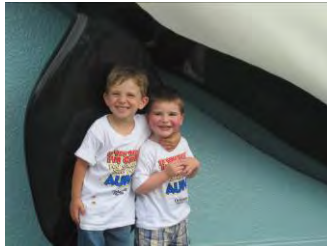
April—vacation with family in Florida