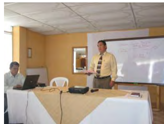
Nov—Attended the Central American pastor's retreat