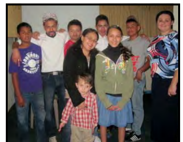
The youth who performed a Christmas drama at Tiloarque