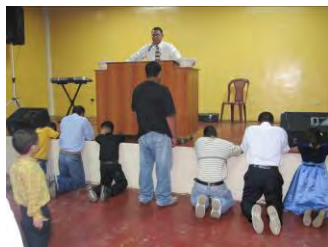
Aug—Visited the revival in San Pedro Sula