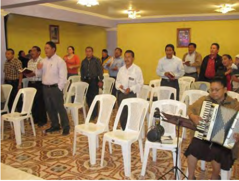
Singing praises to the Lord