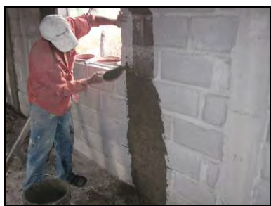
Getting the walls ready for painting