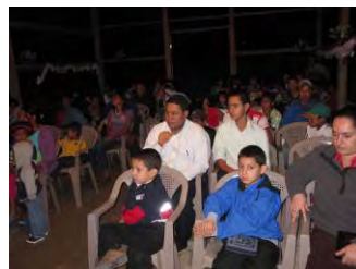
Oct—Las Uvas church celebrated two years