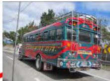
A colorful bus in Guatemala