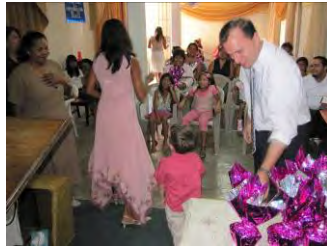
May—A special Mother's Day service with our people