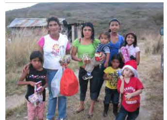
Dec—Handed out toys to poor children for Christmas

Thank You For All Your Prayers and Support During 2010! May God Bless You!