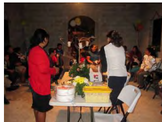
Dec—Held our annual Christmas banquet