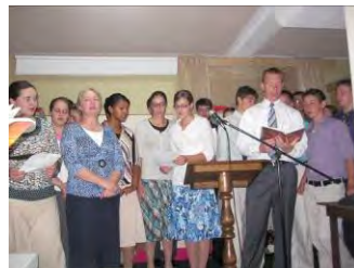
Aug—Youth group from Beavertown PA ministered in our churches