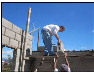
Learning to lay block