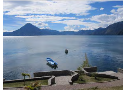
Beautiful Lake Atitlan