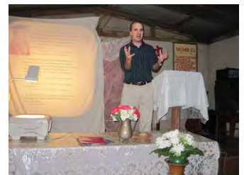
Nov—Held a weekend meeting on holiness in Nicaragua