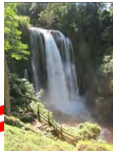
The beautiful Pullhapanzak waterfall