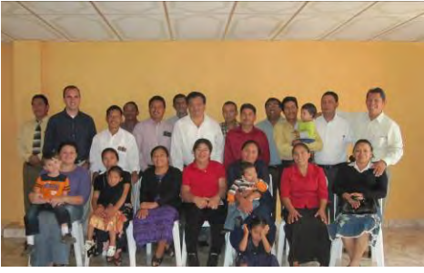
All who attended the retreat. Some are Bible school students.