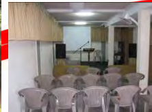
Our ladies made new curtains for the Tiloarque church.