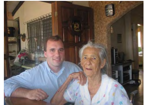
A few weeks after her fall