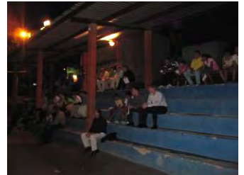
Aug—Held an open air campaign on a soccer field