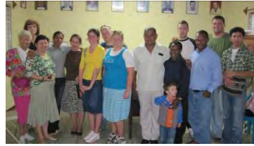
Feb—Accompanied a TLC team in Nicaragua